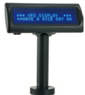
Stand-alone model with Round Base.