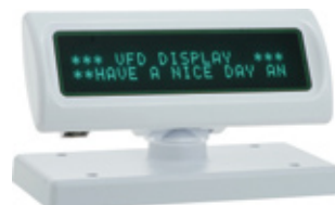
Cool White Available.