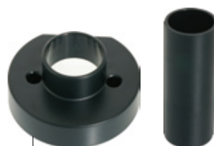
Round Base and Pole Adapter are for optional.