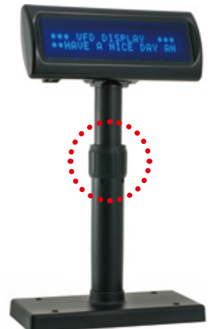
Stand-alone model with Stretching Pole.