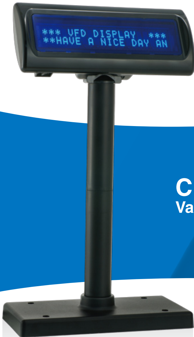
Stand-alone model with 2 poles.