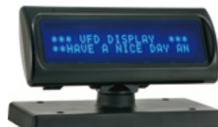
Attached to base without poles.