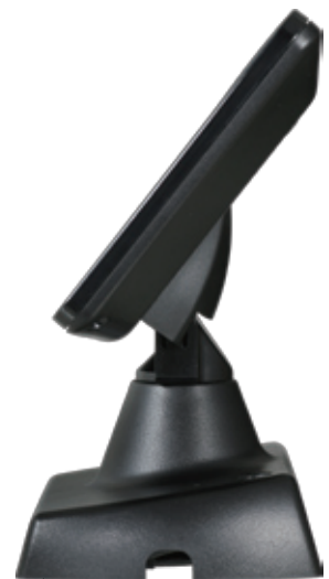
Ultra Slim Design can fit your POS System perfectly.