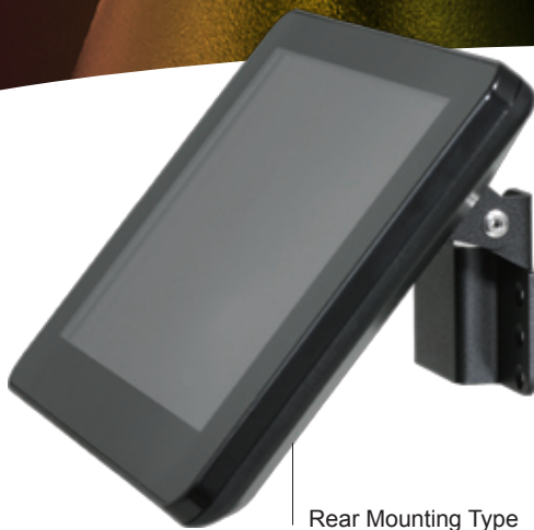
Rear Mounting Type