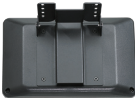
VESA 75x75 supported.