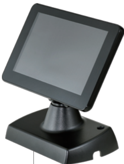
Stand-alone Type w/o Pole